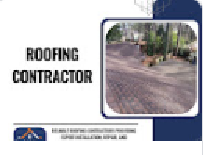
Roofing Contractor Roofing contractor