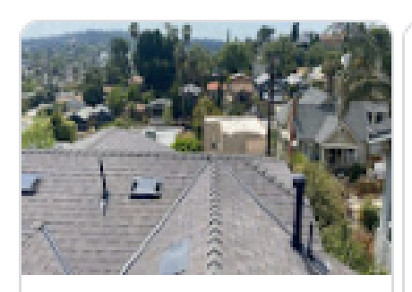
Roof replacement Roofing contractor