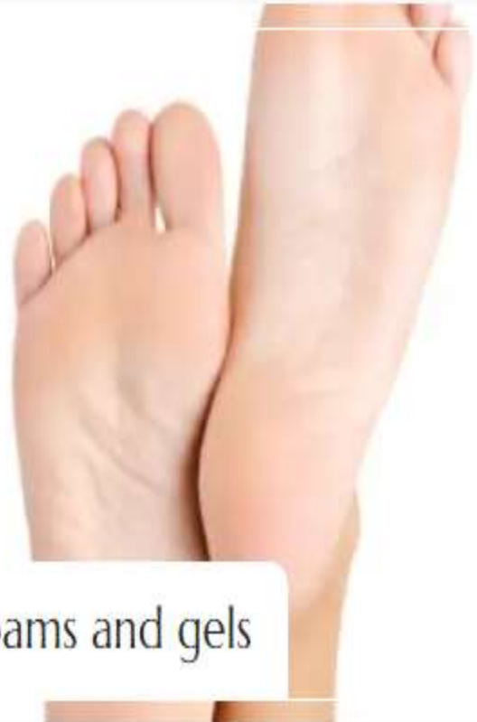
Foams and gels