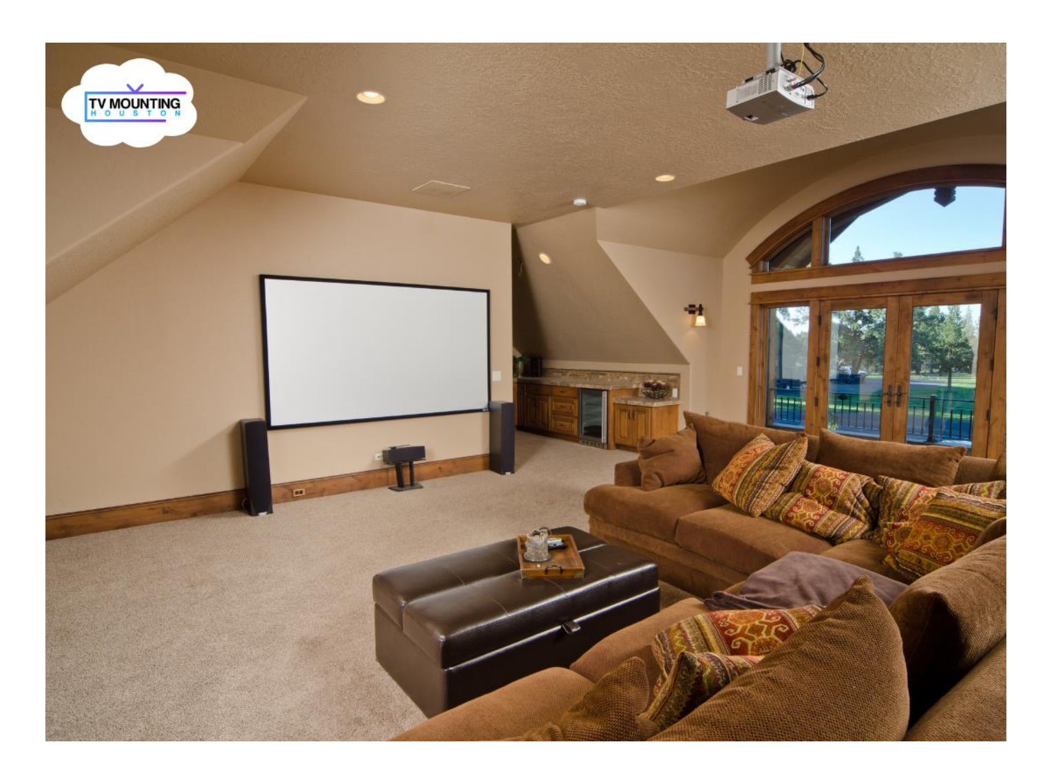
What to Consider When Choosing a Home Theater System

A home theater system can transform your home into a cinematic oasis, where you can enjoy movies, TV shows, video games, and other media in stunning audio and visual quality. If you're looking to set up a <a href="Home Theater Setup in Houston">Home Theater Setup in Houston</a>, TV Mounting Houston is here to help. We offer a wide range of home theater setup services, from simple soundbar and TV installations to complex projector and surround sound systems.